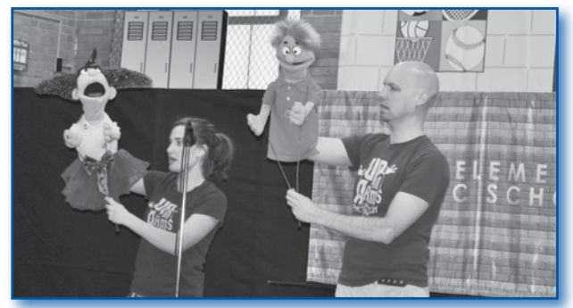
The puppeteers are showing the students how they make the puppets talk.