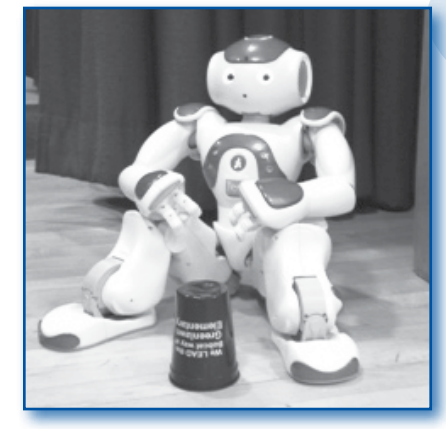
Our special guest Elwood the robot introduced the theme and lead all in our brand new Greenlawn Pledge.