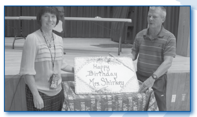
Recognizing important birthdays (especially the "Leader!")